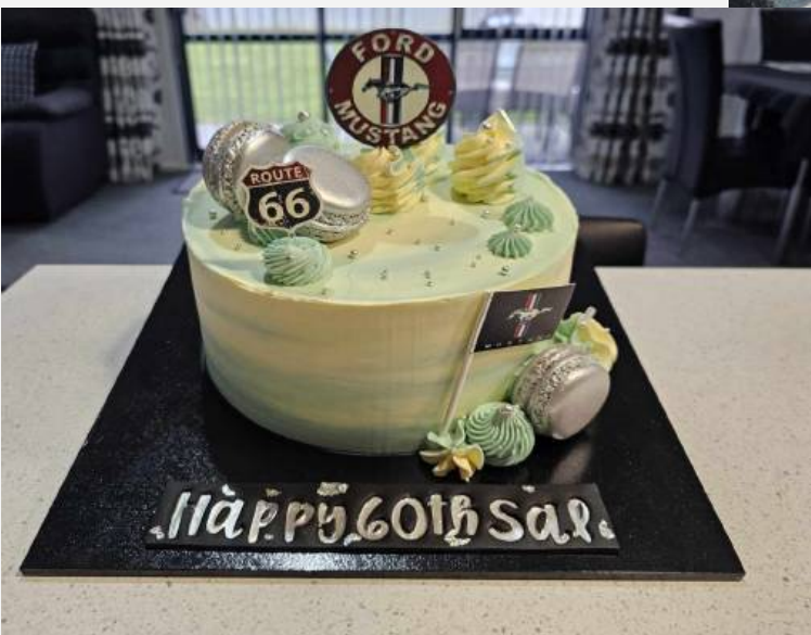
They even baked a 60th birthday cake for "Sal"