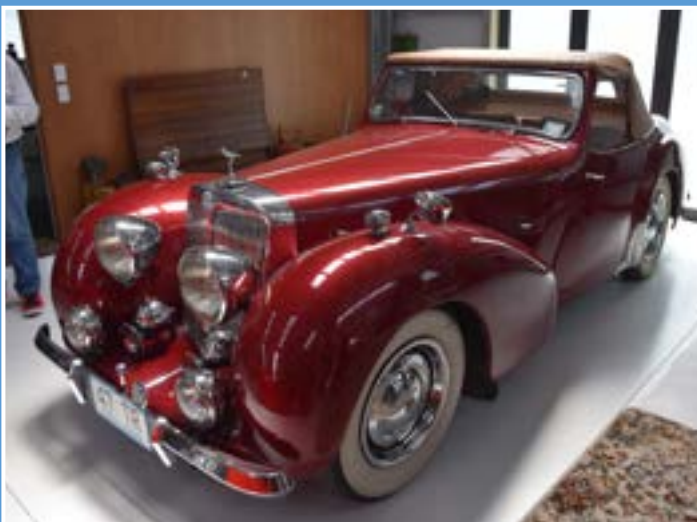
1947 Triumph Roadster

In the last issue of the news I did not have to hand the description of these vehicles that were on display at Broadoak. The owner has now provided these.