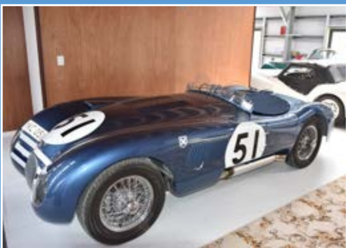
1953 Jaguar C Type Roadster XK120