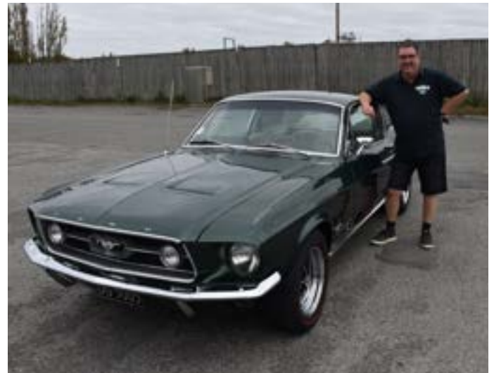
Forbes Gourlay Fastback 289 C4