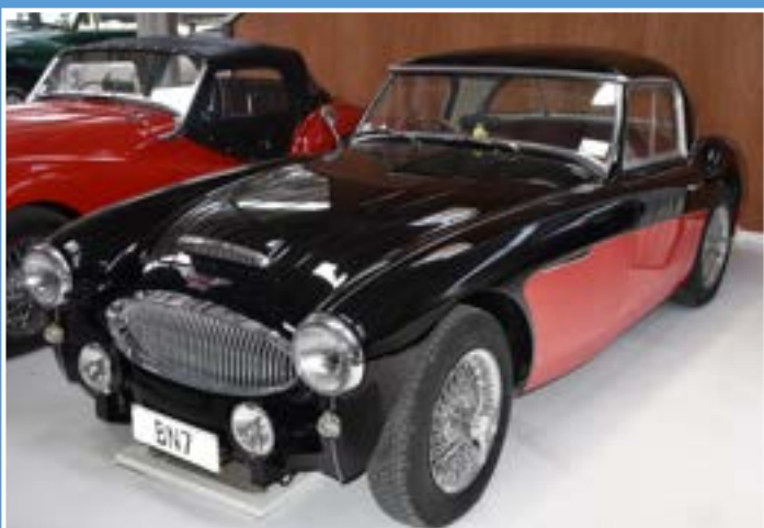
1962 Austin Healey 3000 Mkii