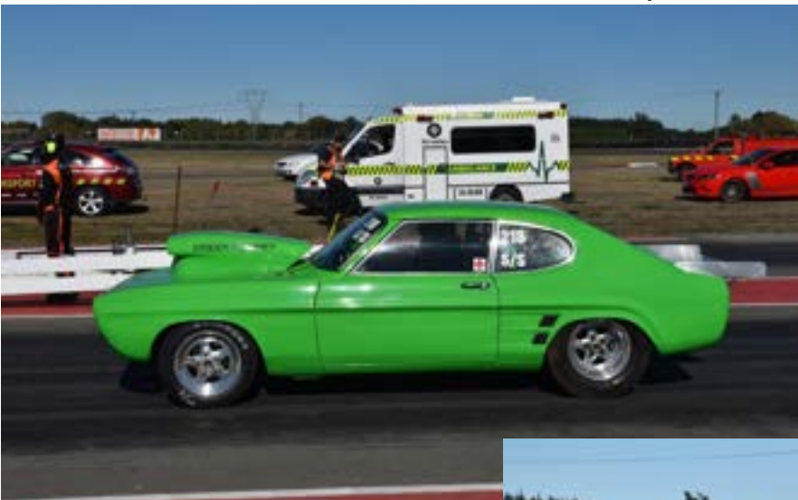
A couple of other special Fords