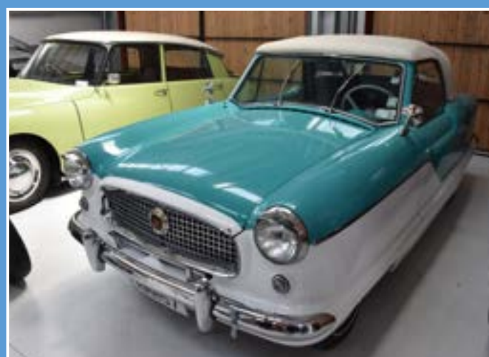
1960 Nash Metropolitan