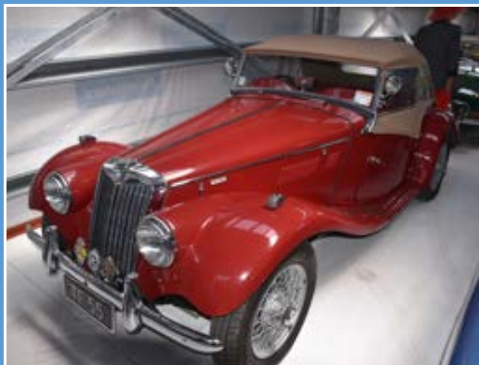
1955 MG TF