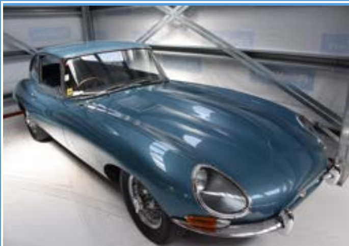
1966 E Type Jaguar