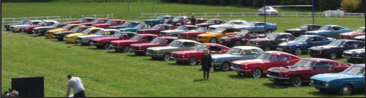
Above: Picnic Lunch Tuatapere Domain