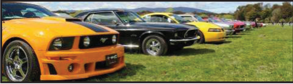
Above & Below: Ponies line the infield at Tuatapere Domain

As you can see he did make it out of town, not without some last minute drama and thanks to the inclement weather, very wet feet.