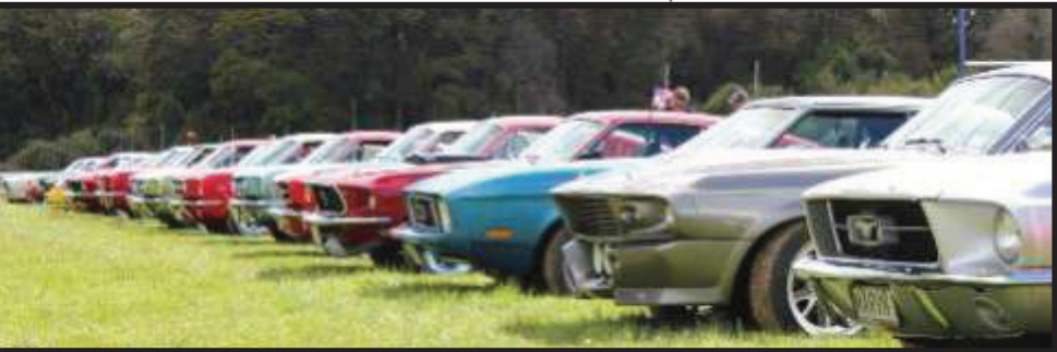
Below: Ponies line up for a gallop around Teretonga Race Track

As you can see he did make it out of town, not without some last minute drama and thanks to the inclement weather, very wet feet.