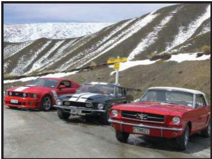
There was a small group who travelled South via Lewis Pass shown here at the Summit (965m).

All groups encountered a variety of road conditions no matter which route or day they travelled ... everything from flooding, fertiliser, stock, road works and rain. Just as well you boys like cleaning !!