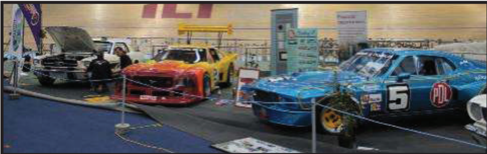
Above: Historic Mustang Race Cars on display at the Car Show