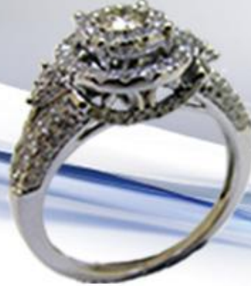
Halo Multi Diamond Cluster 14k White Gold 1.00ct of diamonds $3,595.00

We pride ourselves in the quality of our merchandise, our diamond rings being some of the best available. Our qualified team will help you with your decision and make your visit to Ron Brown Jewellers a memorable one.