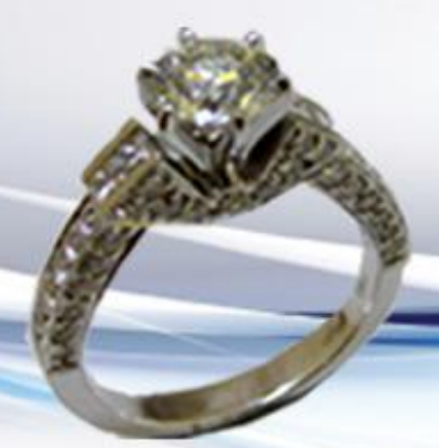
Stunning One Carat Centre Multi Set 2.00ct in total $15,270.00