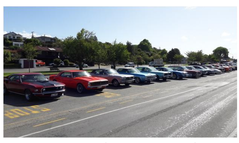
A few of the cars lined up at Pleasant Point.

South Canterbury Heart Kids would like to say a big thank you to the Canterbury Mustang Owners Club for their continued support.