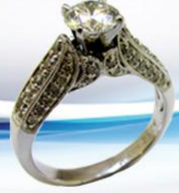
Elegant Solitaire Very European 14k 1.25ct tdw. $11,600.00