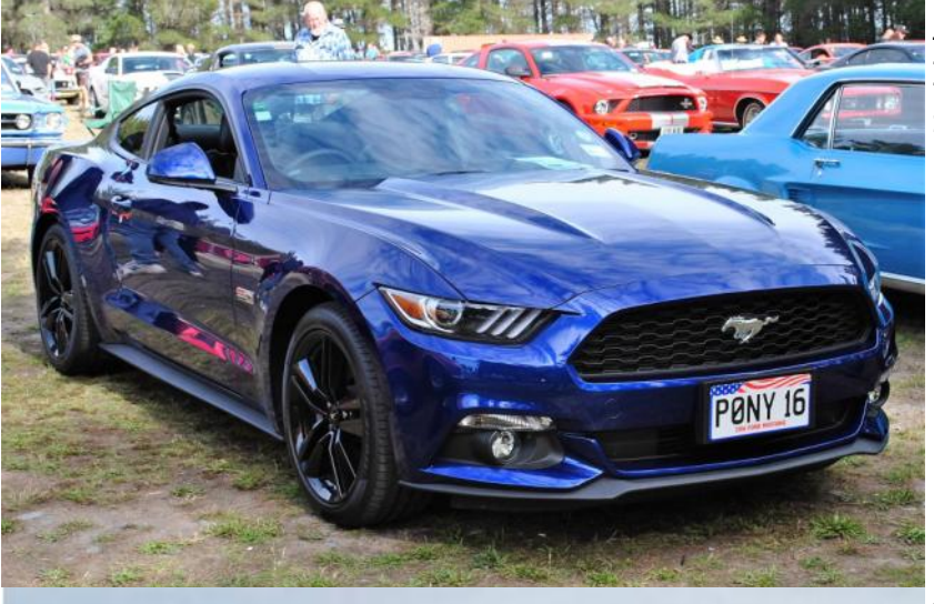
A 2016 Ford Mustang in Lightning Blue with the number plate to match.