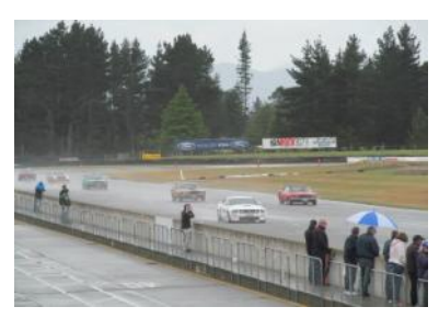
Check your club email for details.

Enjoy some track time at a pace that suits you.