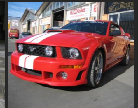
Vehicles featured on this page are a sample of some of the work that Steve undertakes