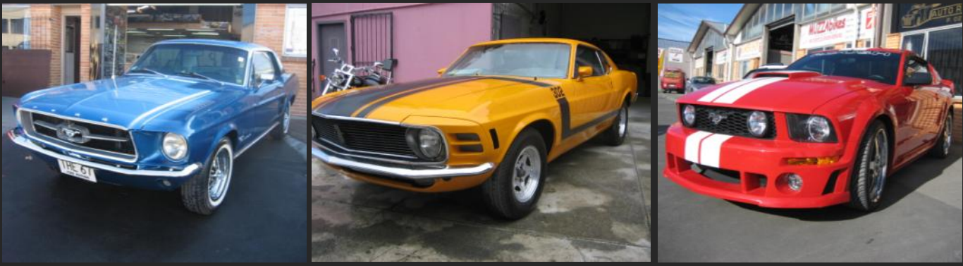
Vehicles featured on this page are a sample of some of the work that Steve undertakes