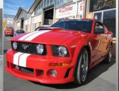
Vehicles featured on this page are a sample of some of the work that Steve undertakes